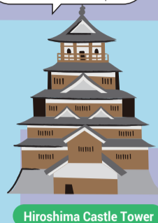
Hiroshima Castle Tower

Includes exhibits of materials, hands-on experience areas, and a museum shop.